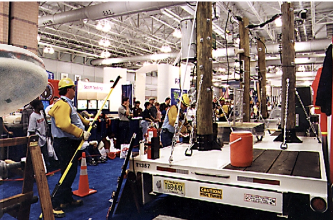
Members of Local 94, Cranbury, New Jersey, demonstrate safe utility operating procedures.