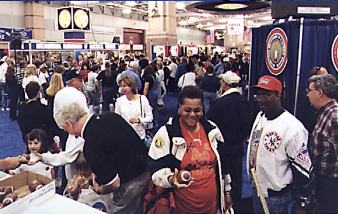
Crowds throng around the IBEW exhibit area.